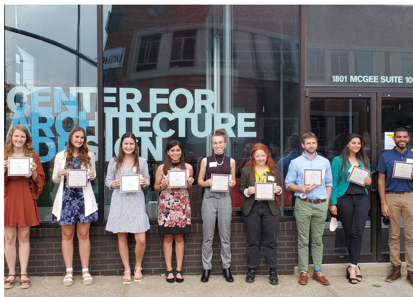
KCAF SCHOLARSHIP RECIPIENTS